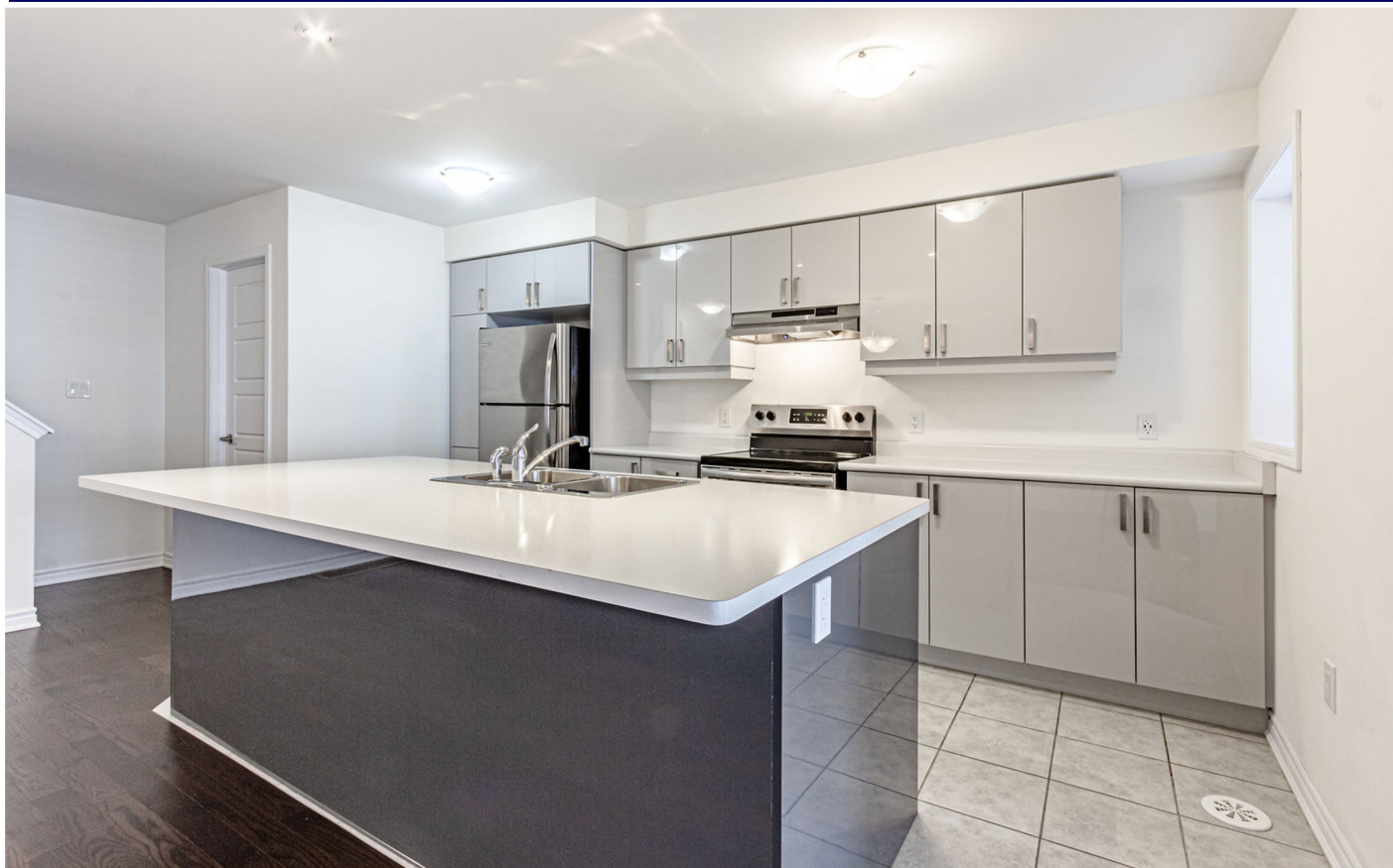
1000 Asleton Blvd #95, Milton, L9T 9L2 3 Beds, 2.5 Baths